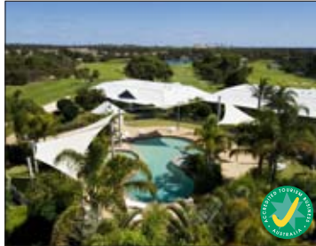
BUNBURY AAA☆☆☆ RE