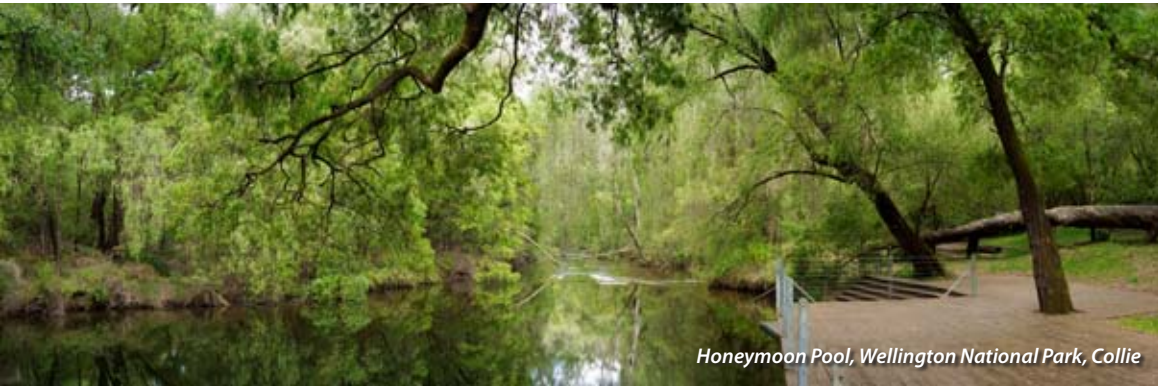
Honeymoon Pool, Wellington National Park, Collie