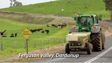
Ferguson Valley, Dardanup