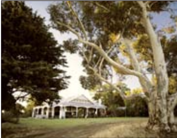
DARDANUP AAA☆☆☆ SC