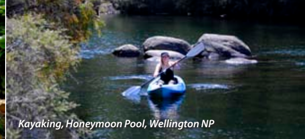
Kayaking, Honeymoon Pool, Wellington NP