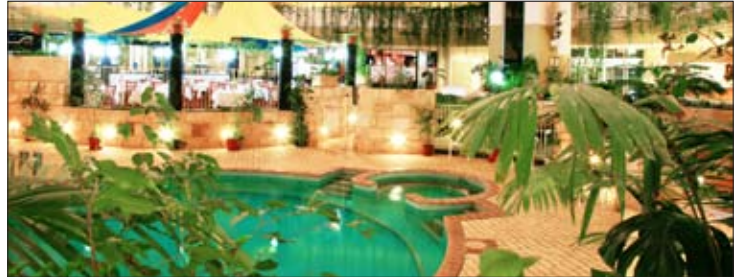
BUNBURY AAA☆☆☆ HO

Old Coast Rd, Pelican Point, Bunbury WA 6230 Tel: 1800 677 309 or (08) 9725 2777 Email: escape@sanctuaryresort.com.au www.sanctuaryresort.com.au