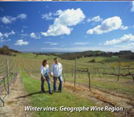
Winter vines, Geographe Wine Region