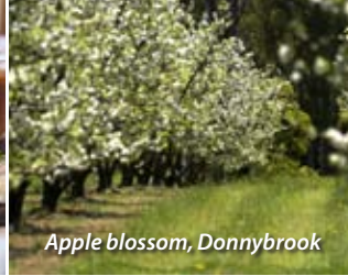
Apple blossom, Donnybrook