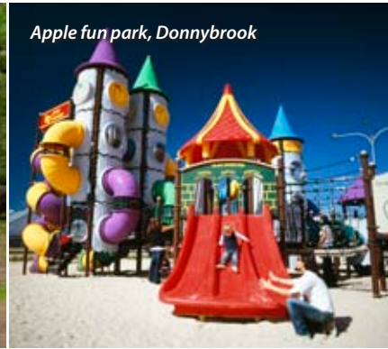
Apple fun park, Donnybrook