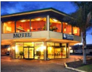
BUNBURY AAA☆☆☆ MO