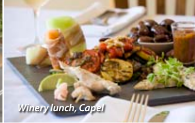
Winery lunch, Capel