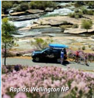
Rapids, Wellington NP