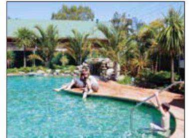
BUNBURY AAA☆☆☆ CP

Ocean Drive, Bunbury - www.lighthousebeachresort.com.au