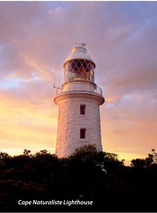
Cape Naturaliste Lighthouse