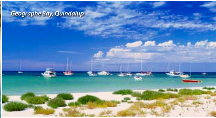
Geographe Bay, Quindalup