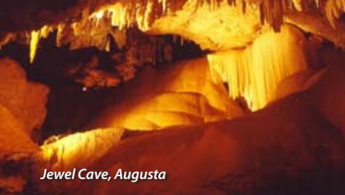
Jewel Cave, Augusta