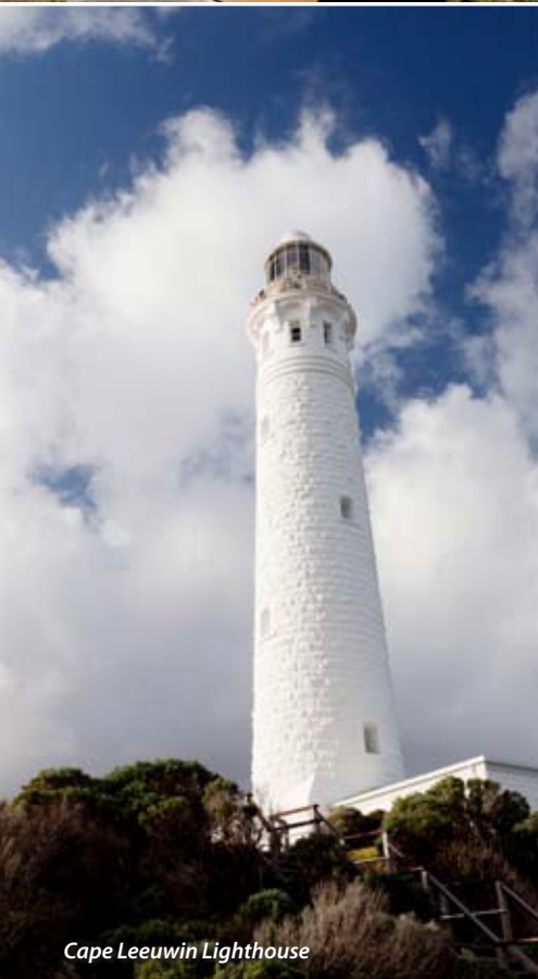
Cape Leeuwin Lighthouse