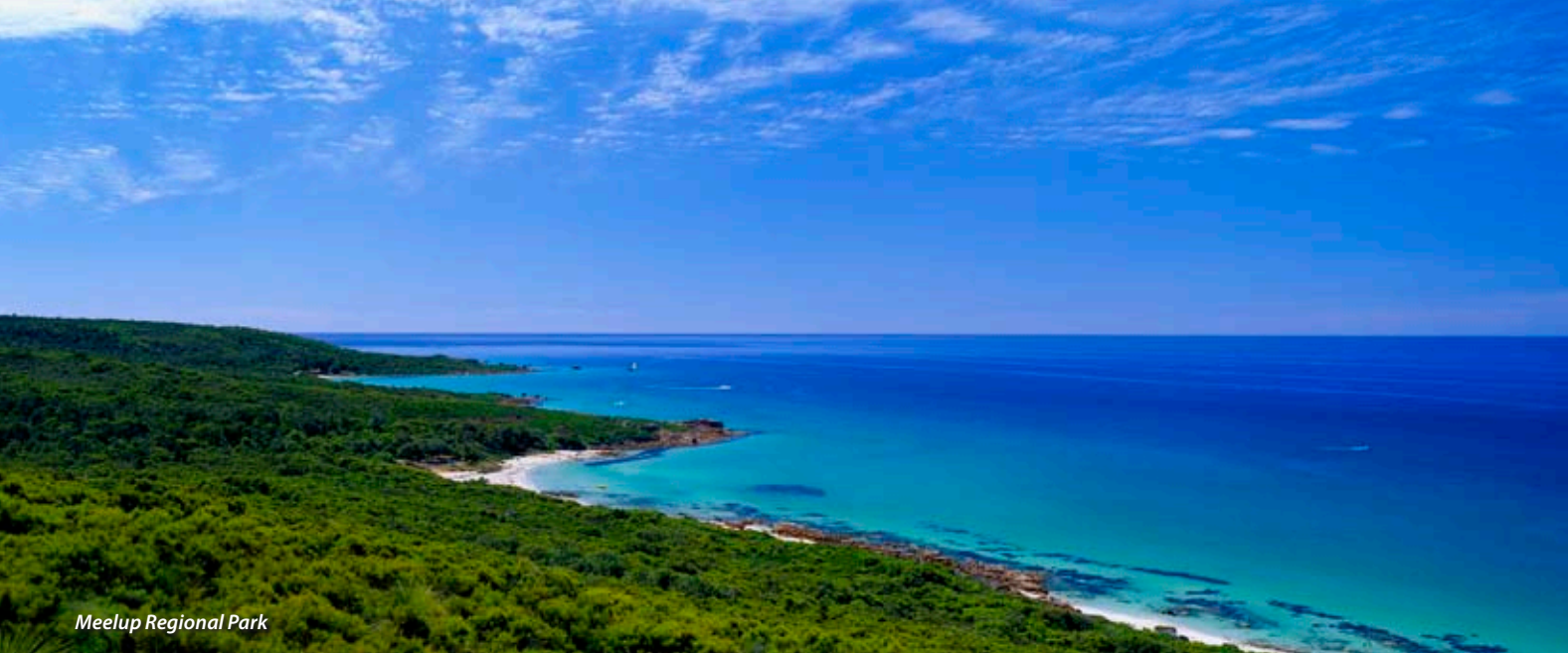
Meelup Regional Park