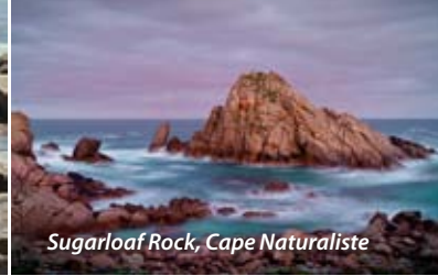
Sugarloaf Rock, Cape Naturaliste