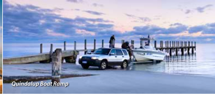
Quindalup Boat Ramp

One of the most beautiful areas along the coast is Canal Rocks, a series of protruding rocks. The area is popular with fishermen and photographers. It's breathtaking on a still day and awesome when it's rough. You'll find wineries, breweries, restaurants, galleries, arts and craft in and around Yallingup. Visitors also come to see the spectacular underground caverns and the beauty of the