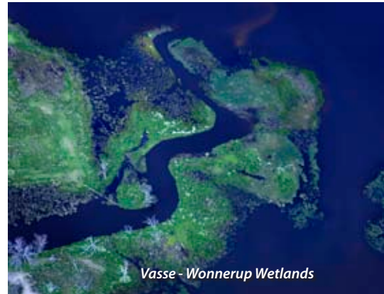
Vasse - Wonnerup Wetlands

The Vasse Wonnerup Wetlands have been listed by the Ramsar Convention as 'Wetlands of International Importance'. So far more than 75 species of birds have been recorded, several of them rare. The wetlands offer sanctuary to a range of nesting, resting and migrating birds. A walk trail off Layman Road leads to a bird hide.