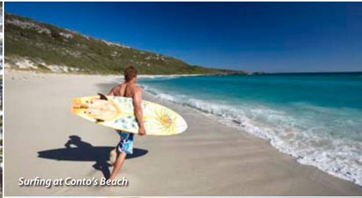
Surfing at Conto's Beach