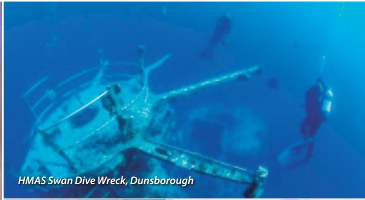
HMAS Swan Dive Wreck, Dunsborough