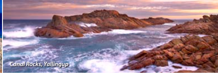
Canal Rocks, Yallingup