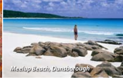
Meelup Beach, Dunsborough