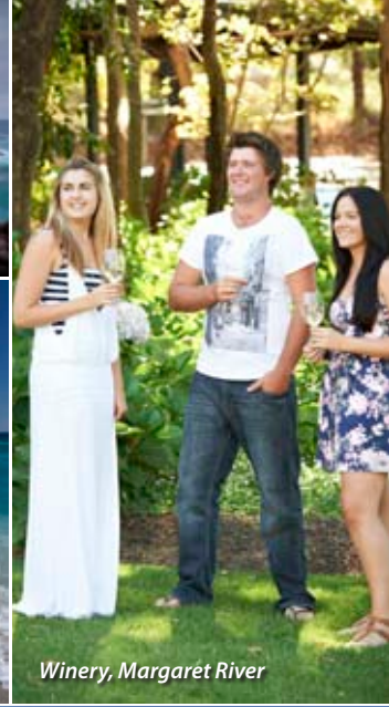
Winery, Margaret River