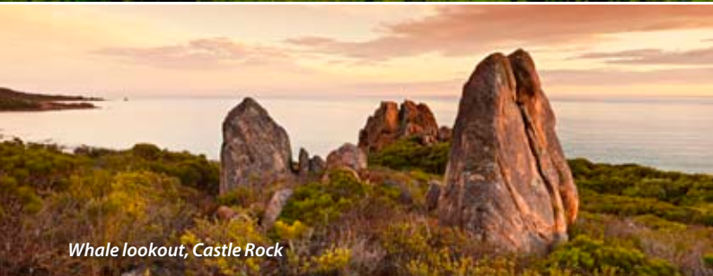
Whale lookout, Castle Rock