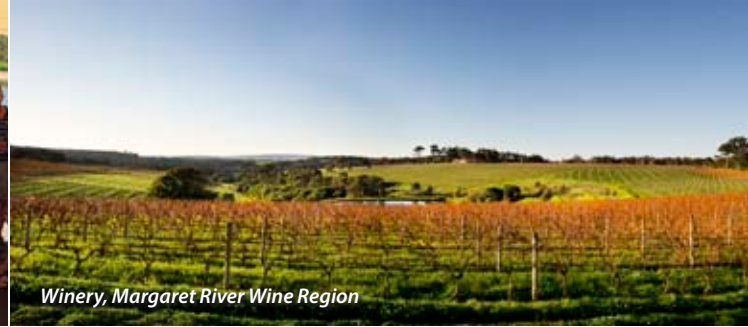
Winery, Margaret River Wine Region