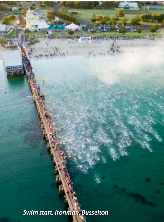
Swim start, Ironman, Busselton