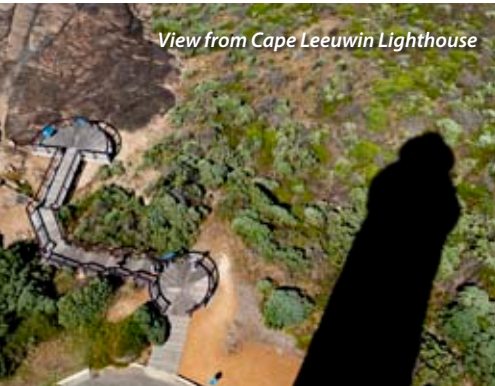
View from Cape Leeuwin Lighthouse