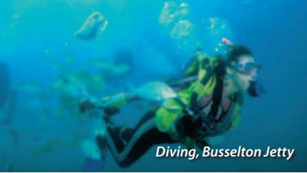
Diving, Busselton Jetty