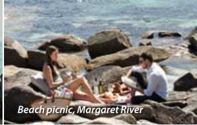
Beach picnic, Margaret River