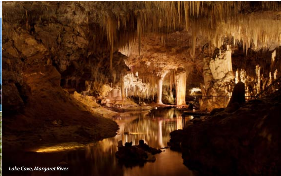
Lake Cave, Margaret River