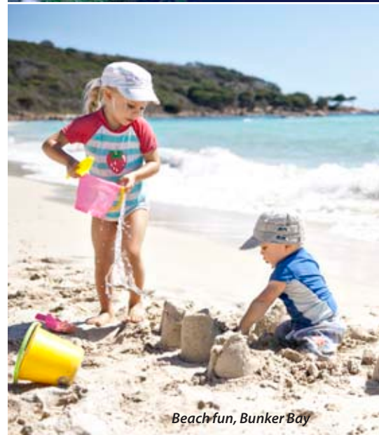
Beach fun, Bunker Bay