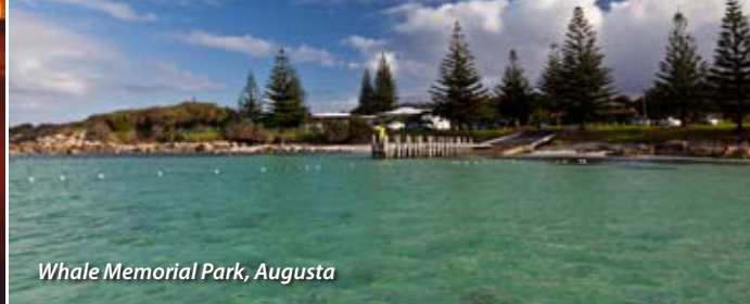
Whale Memorial Park, Augusta